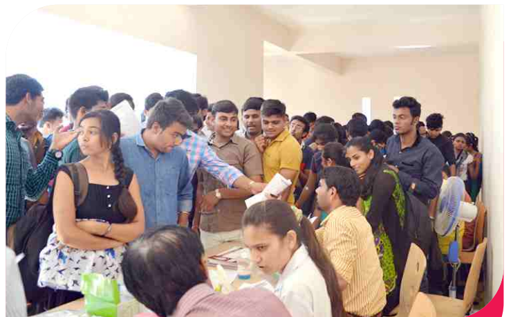
Can I donate blood ?

Over and above students, faculties as well as many staff members also shadowed their responsibility towards society by contributing in this donation and thus motivated the students for the same. As a part of encouragement, the donors were bestowed with small gifts as well as a certificate acknowledging