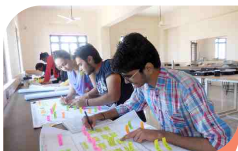
Implementation of Idea on Canvas