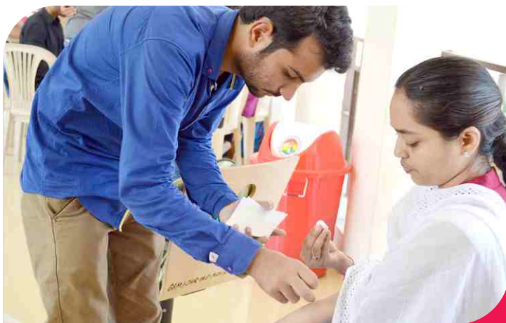
Volunteers being plateful towards donors

The consciousness regarding "Blood Donation & its importance" amongst the students was easily palpable through the registration desks engaged with elongated queues. An exclusive portrait was displayed with gallant aroma where every soul desired to donate their blood and ended up with the glee of being eligible for blood donation or with disappointment for not being among those. Astonishingly many of donors after donation encouraged other friends to involve in this as well as