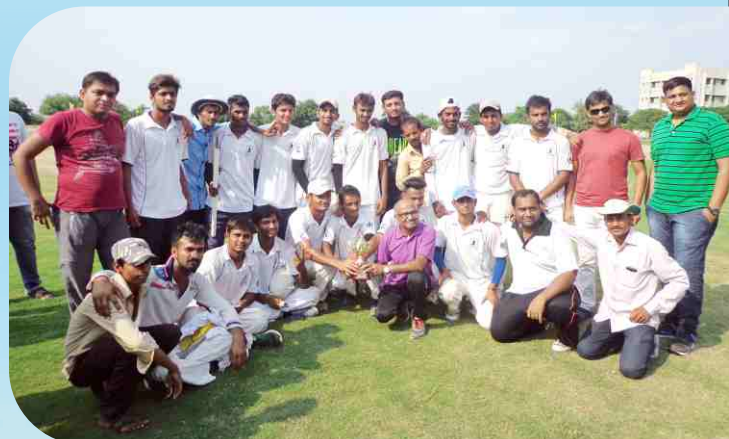
Winning Moment - an end can't be better than that