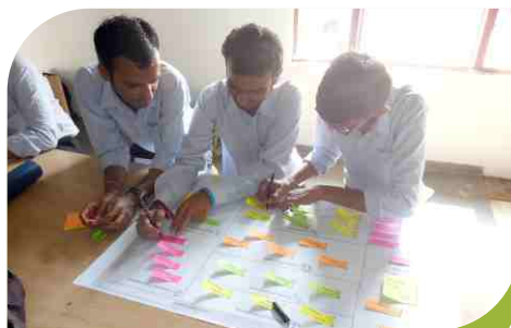
Showcase of Ideation