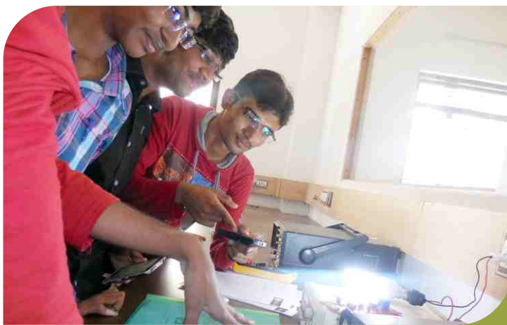
Home Appliances control using Infrared Communication

Sem/Branch/Subject: 5th EC Electronics Communication