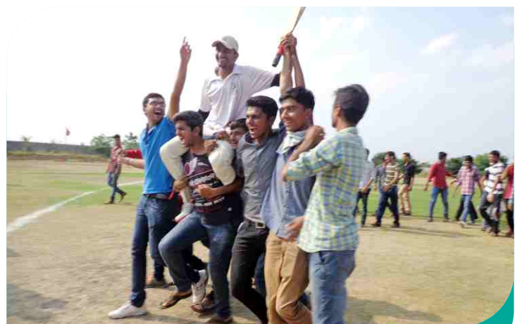
Time to celebrate: students praising captain for his wining knock