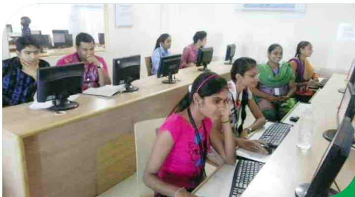
Making Hand strong on Know-how of computer