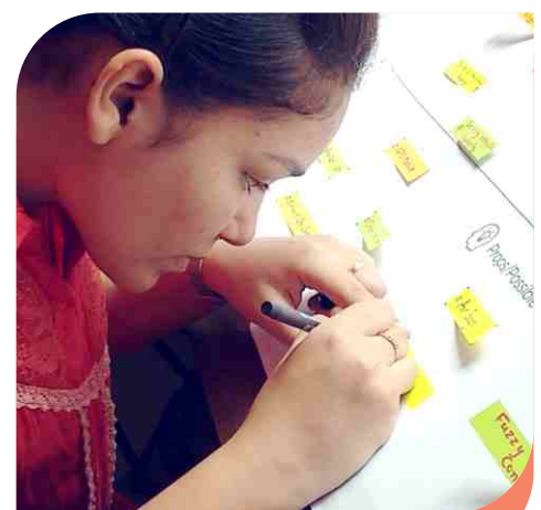
Perfect Involvement in Canvas Preparation

Through Design Engineering, Students came to know about how to develop a complete product from Project.