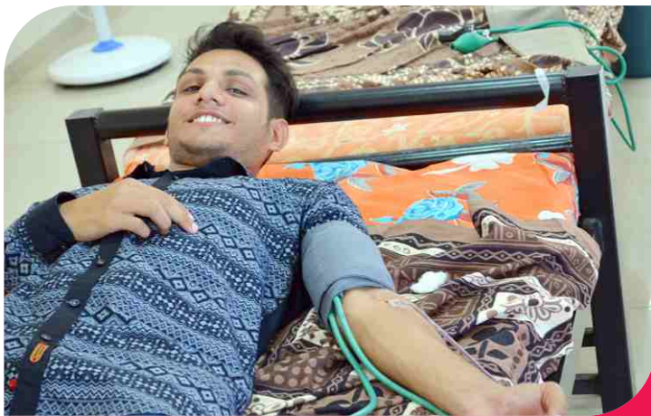
At the summit of satisfaction

As per the enriched ethnicities of Gardi Vidyapith, a "Blood Donation" camp was well thought-out in connotation with the "Field Marshal Blood Bank" on 01st October, 2015 at Gardi Vidyapith. In this activity, round the day about 180 students and faculties satisfying the conditions donated their blood and made themselves as well as the institute feel proud on this generous deed.