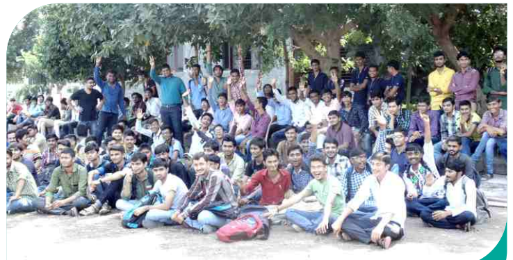
Audience supporting the home team on big Final day