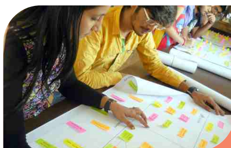
Brainstorming on Prepared Canvas