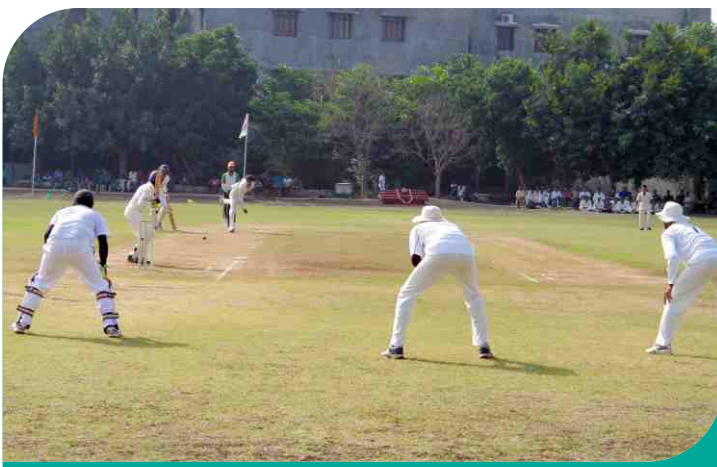
Settlement of field to conquer the opponent