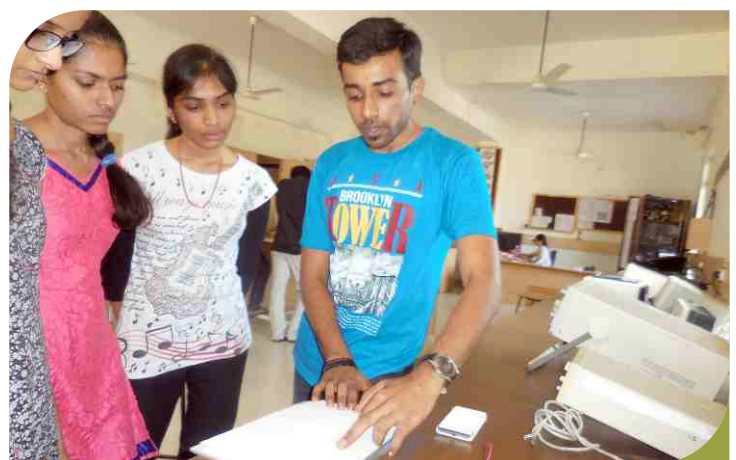
Section wise circuit explanation to spectators