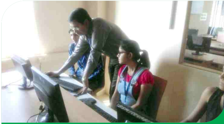
Taking the help of expert