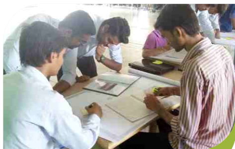
Brainstorming for Canvas Preparation