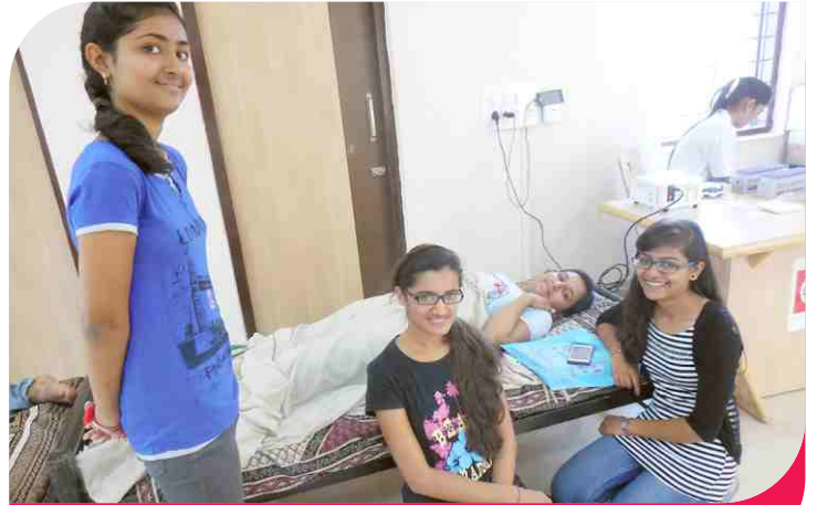
Solid ladies undertaking the charge.

helped the other contributors by providing them with snacks & glucose drink arranged to eradicate the faint effect. This was certainly a marvelous act envisaged.