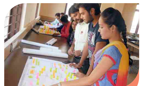
Canvas Observed By Faculty