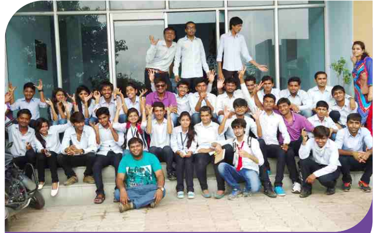
Memories fetched after visit

The visit set sights on enhancing the significance of the subjects