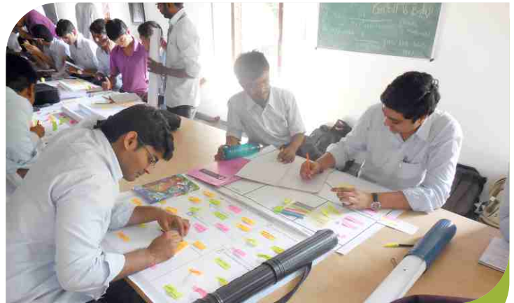
Amalgam of creativity and technical content

Skill Magnification: This canvas activity increased alliance and Innovation of students while improved curiosity for their project work.