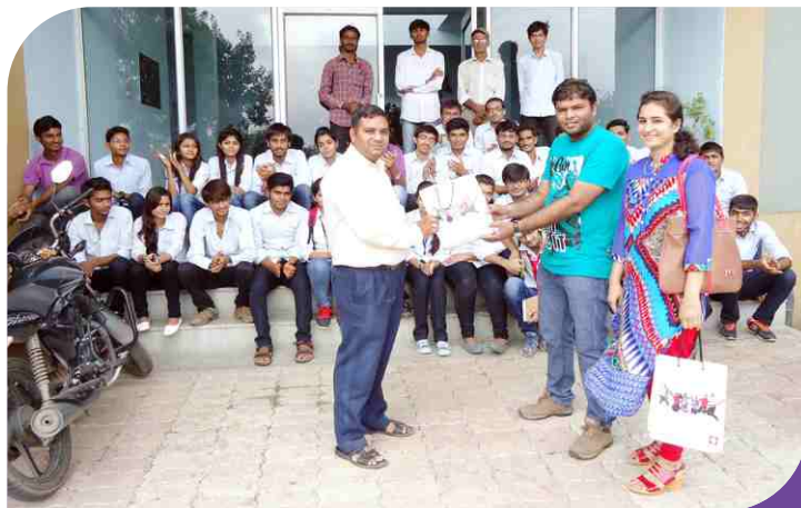
Presenting the momento