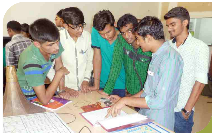
Satisfied curiosity of Junior students about wireless communication.