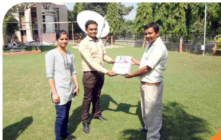
Faculties of Gardi are giving Talent of thanks to instructor of BISAG

Then we had visited the control room. The Audio signal and video signal generated from studio is captured at the control room and then controlling of that signals are taken place. The