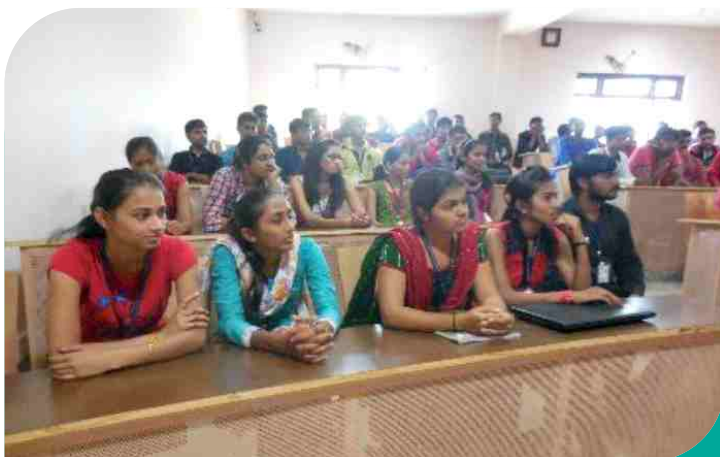
Students enthusiastically learning