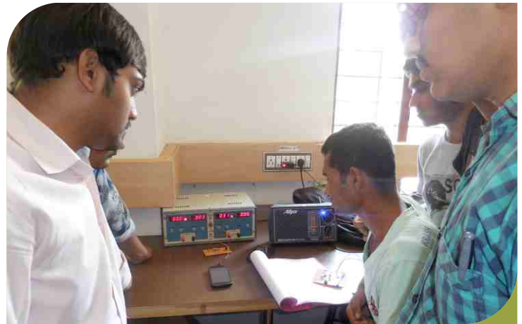
Successful Demonstration of Short wave transmitter built by students

It's such a great opportunity for us to improve our Technical Knowledge in Various field of electronics and communication.