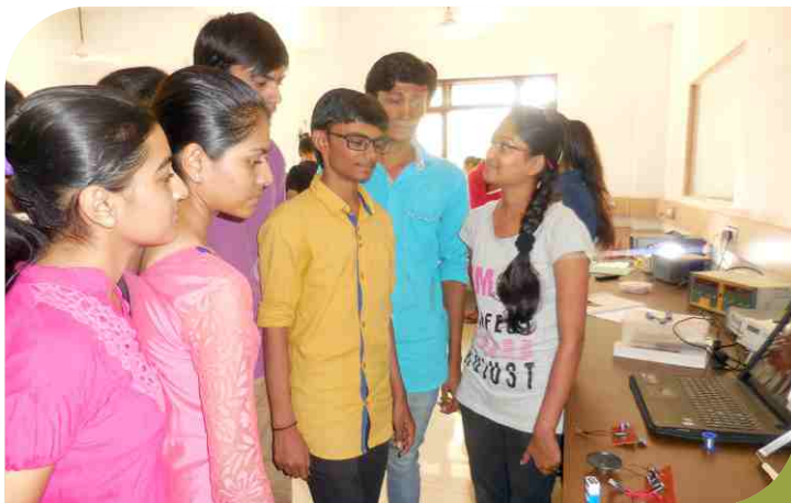
Students Explaining their project about Application of Ecomm in Antitheft Luggage.