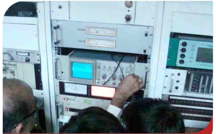
Concept of Modulation Explanation