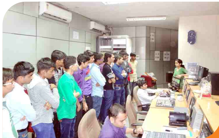
Explanation of Control room and its equipment

The industrial visit is considered as the most tactical methods of teaching. It provides students with an opportunity to learn practically through interaction, working methods and employment practices. Visiting a company gives students a practical perspective on the world of work, it gives them