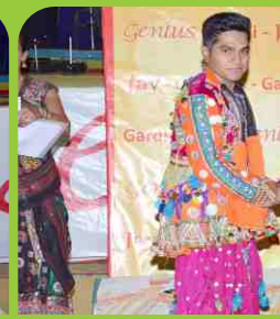
"The glimpses of Gardi Vidyapith's enchanting atmosphere, esteemed guests and..."